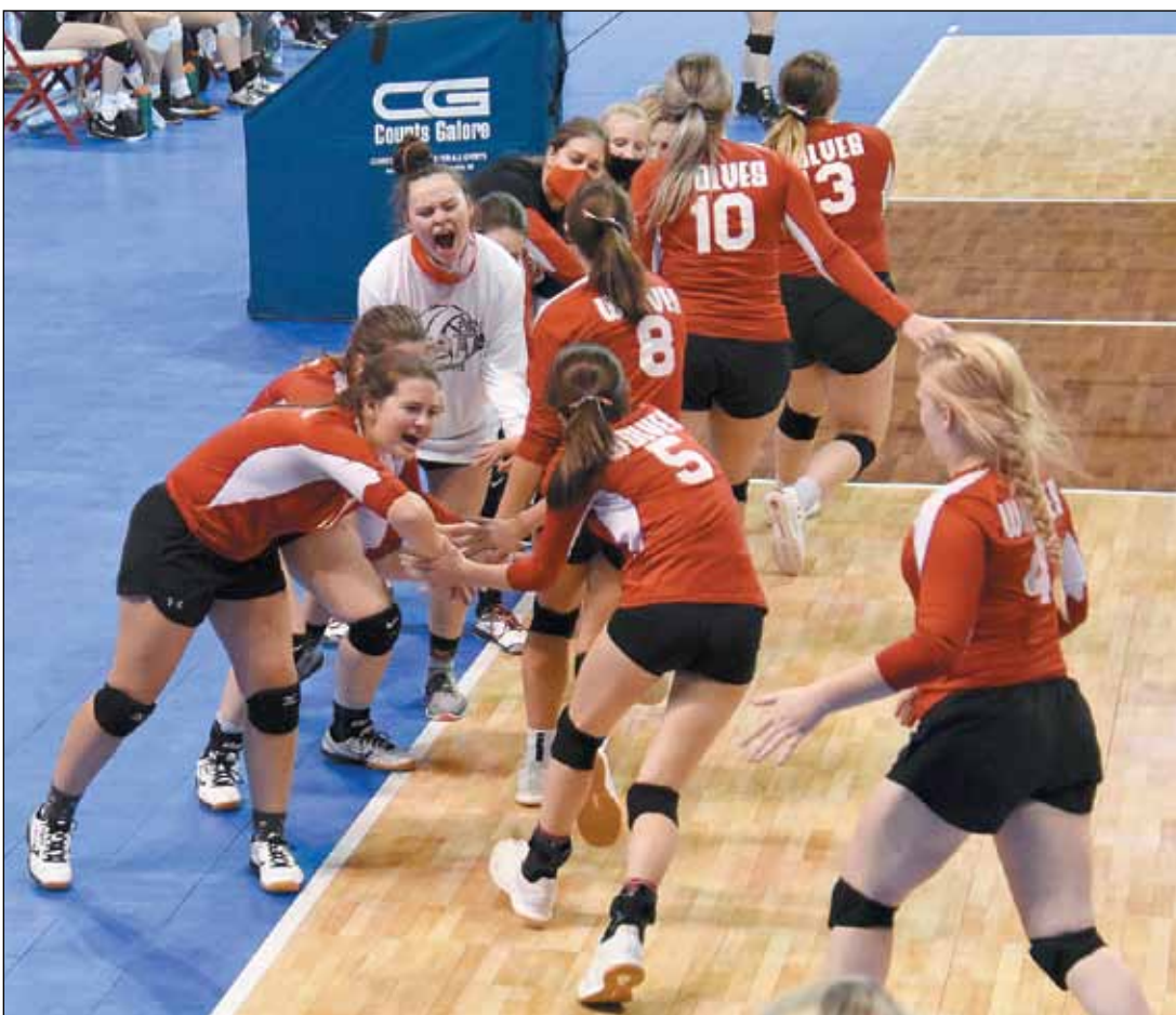
The Lebo Lady Wolves share smiles and slap hands during an enthusiastic show of team spirit before one of their state tournament matches.