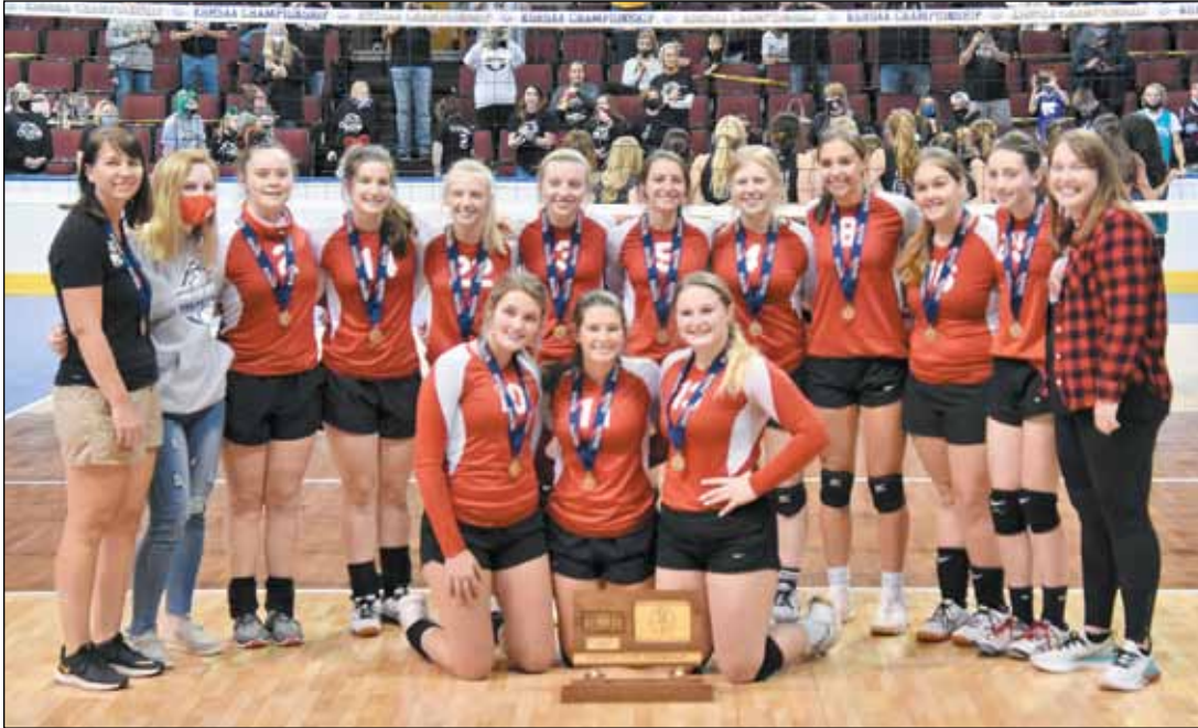
The Lebo Lady Wolves are the 2020 Class 1A Division I State Runners-up, having gone 3-2 in the state tournament Saturday, Oct. 31.