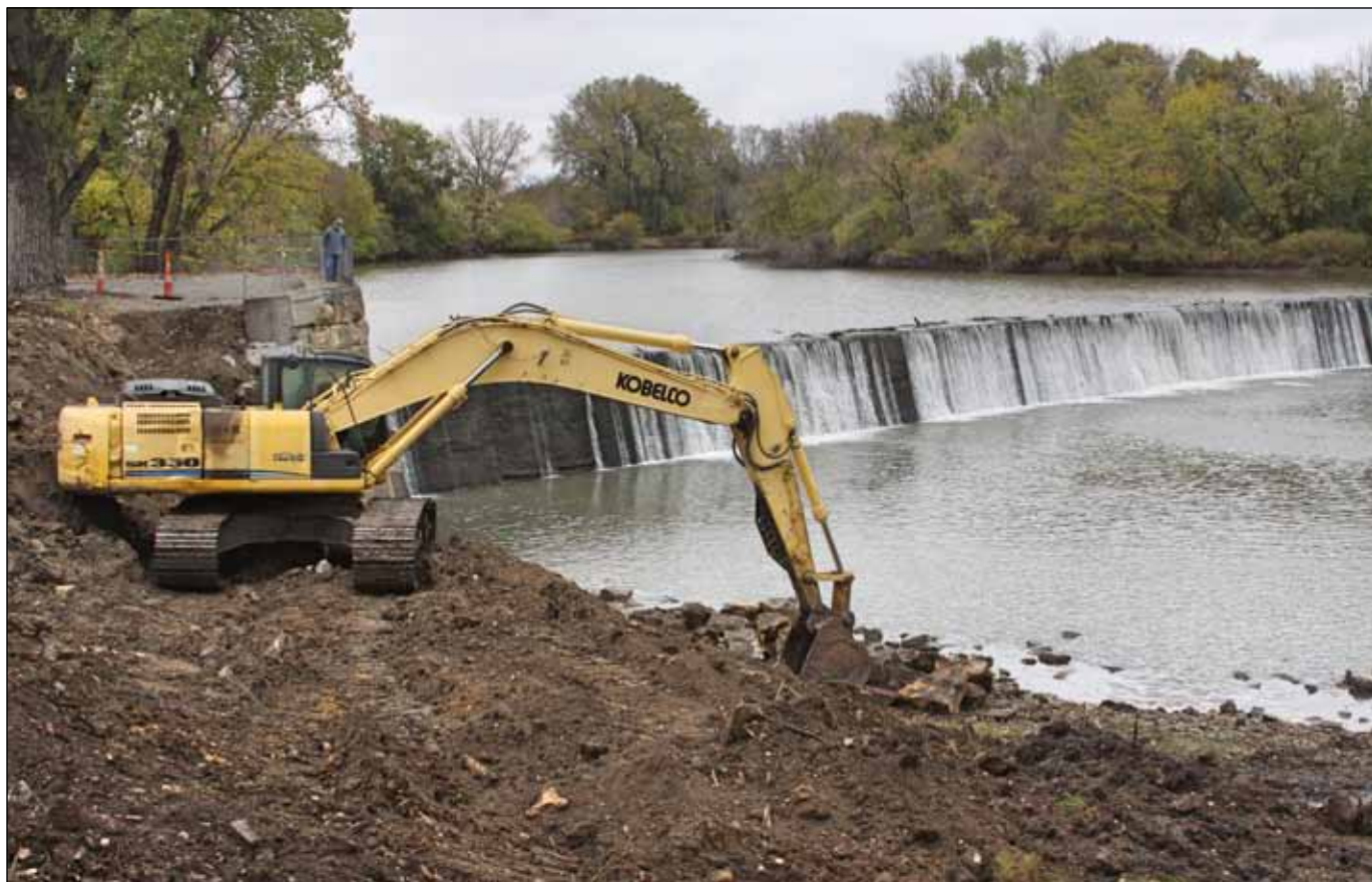
B & B Bridge Co., St. Paul, began work last week to repair and replace a retaining wall at the Burlington City Dam. A number of onlookers have been visiting the area to view the progress. Work should be completed within 90 days.