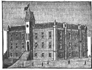
One of the videos on the museum's YouTube Channel and Facebook page is the history of the short-lived Kansas College located in Burlington.

The Coffey County Historical Society and Museum is dedicated to preserving the history of Coffey County and its people. We, at the museum, want to record this current historic time for future generations. Please share your stories about how COVID-19 affected you. How did you feel once the virus hit the state and the community? How did it affect your job? How did it affect your daily activities? How did it affect your shopping trips? We are also searching for photographs, i.e. playgrounds being taped off, lines in front of Hoover's, closed signs, etc. Send your stories and photographs to the museum at 1101 Neosho St, Burlington, KS 66839 or email to erin@coffeymuseum.org or shirley@coffeymuseum.org .