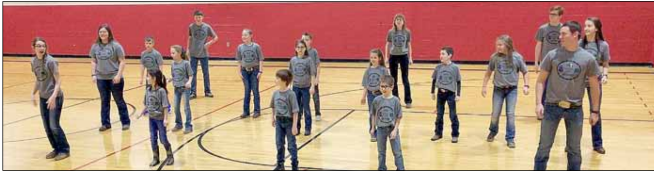
Tip Top Dance