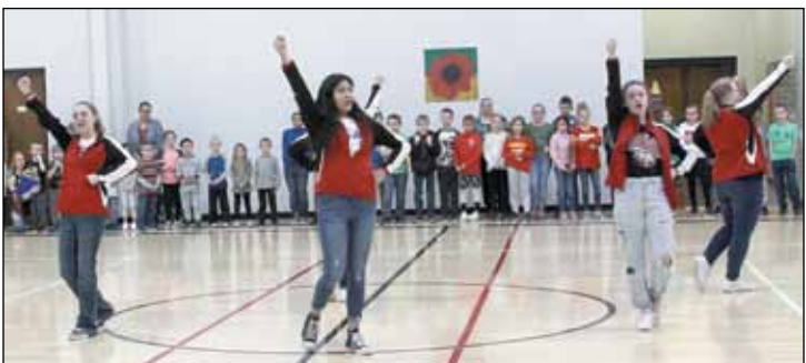
The BHS wrestling cheerleaders perform a cheer during the state send-off assembly at Burlington Elementary School. A squad consisting of both the BHS wrestling and basketball cheerleaders also performed a dance prior to the championship finals of the Class 4A State tournament Feb. 29.